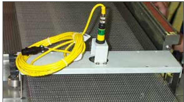
Figure 2. Product Sensor

The cutoff distance is fixed (see Table 1). Objects lying beyond the cutoff distance usually are ignored, even if they are highly reflective. However, it is possible to falsely detect a background object under certain conditions. False sensor response will occur if a background surface reflects the sensor's light more strongly to the near detector (sensing detector) than to the far detector (cutoff detector). The result is a false ON condition. To cure this problem, angle the sensor slightly so the background does not reflect light back to the sensor.