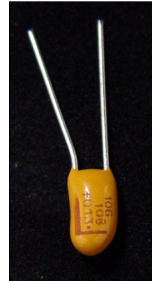
Typical tantalum capacitor showing polarity, positive (+) is on left