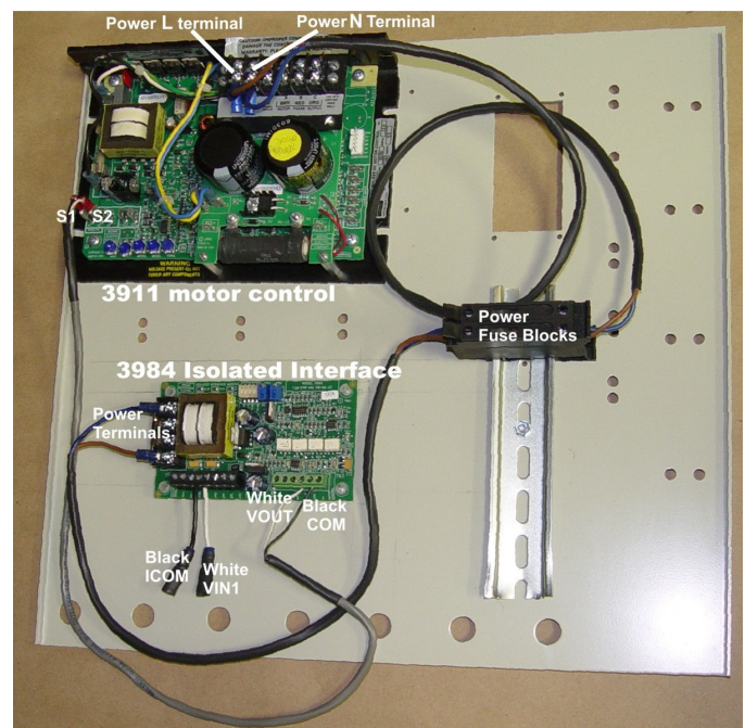
Figure 1 Motor control Panel Layout