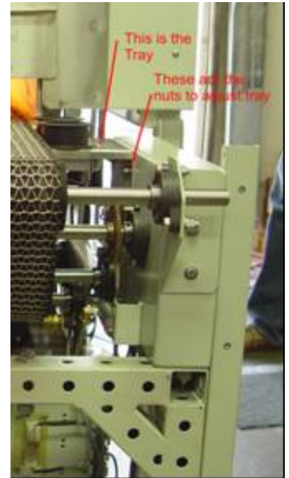
Tray and adjustment screws and nuts