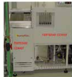
Side covers at furnace exit

Furnace Exit. The Quartz Rods mounted on the belt support tray should be aligned with the quartz tubes in the furnace chamber. Align the rods so the top of each rod is just below the tops of the respective chamber tube