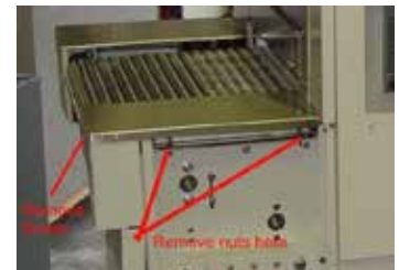
Top covers at furnace exit

2. Then remove the stainless steel top covers on both sides by removing two nuts at the bottom and 1 screw at end of cover.