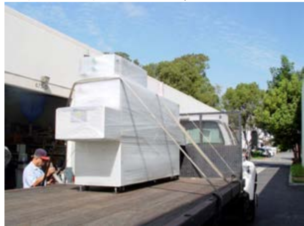
LA-306 pickup for American Export