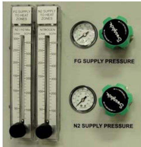
Controls for Optional Supply Gas Mixing System