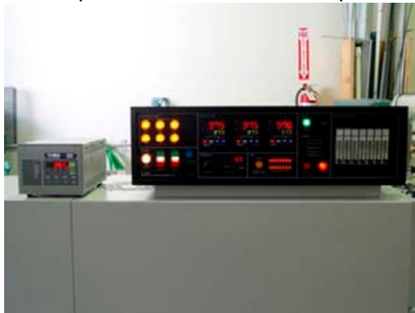
LA-306 Low O2 Trials @ 975C, belt speed 50 mm/min