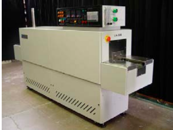
LA-306 Compact Annealing Furnace (3075 mm L x 500 mm W x 1615 mm H)

Three zone 1000C IR Furnace with 150 mm W belt and 50 mm H throat (furnace internal height) manufactured Chow Sang Sang Jewellery (Hong Kong) for 600-950C annealing of platinum, gold and silver and alloys in a nitrogen and/or forming gas environment. Total heating length is 760 mm, cooling is 1140 mm. Supply gas mixing option allows fast switching between premixed Forming Gas (N2/H2 mix) and pure Nitrogen atmosphere. Pictures taken at our facility in Orange, California. Shipped 9Oct2012.