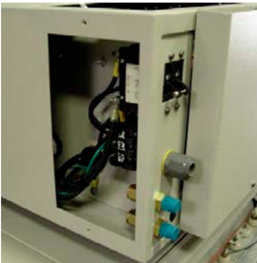
Control Console showing three options: