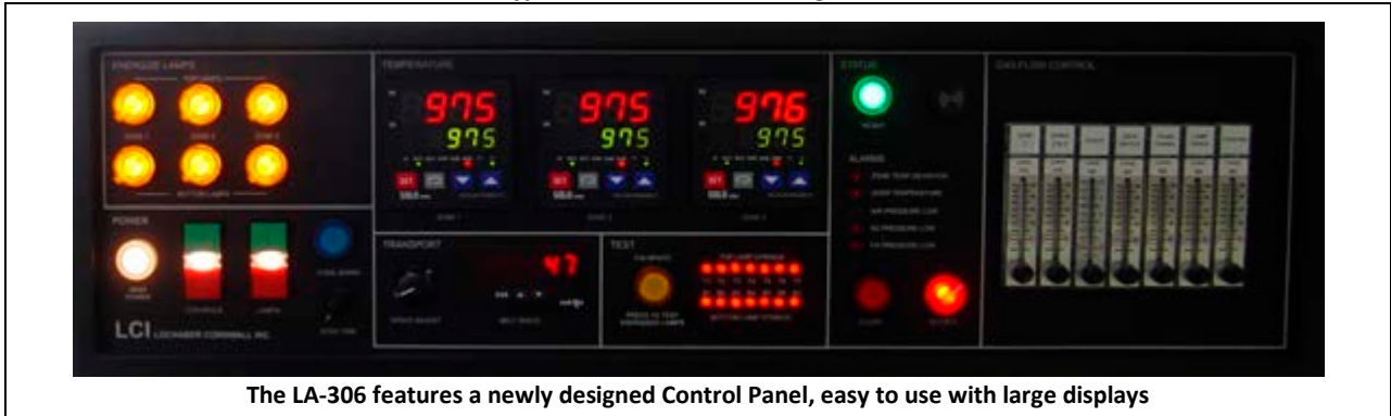
The LA-306 features a newly designed Control Panel, easy to use with large displays