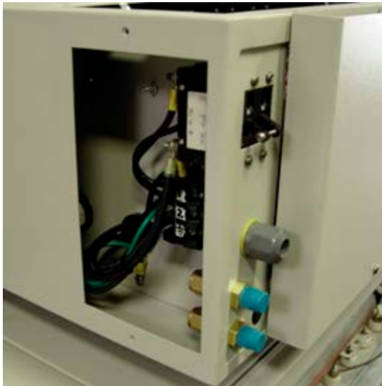
Control Console showing three options: Circuit Breaker; Dual Process Gas; and Sample Port