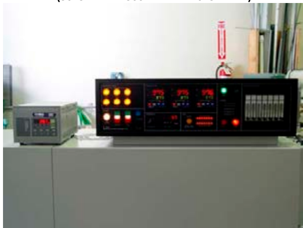
LA-306 Low O 2 Trials @ 975C, belt speed 50 mm/min