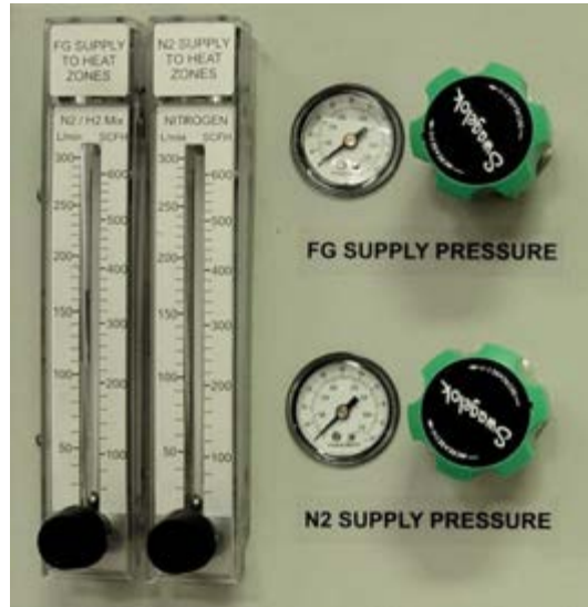
Controls for Optional Supply Gas Mixing System Only available on Dual Gas Furnaces