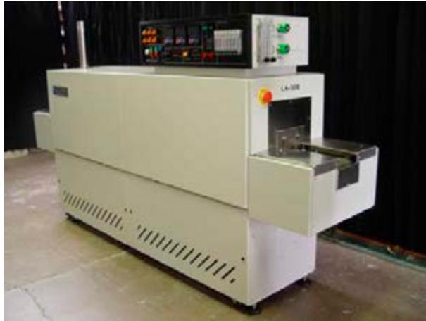
LA-306 Compact Annealing Furnace (3075 mm L x 500 mm W x 1615 mm H)

Three zone 1000C IR Forming Gas Annealing Furnace with 150 mm W belt and 50 mm H throat (furnace internal height) manufactured Chow Sang Sang Jewellery (Hong Kong) for annealing platinum, gold and silver alloys in a nitrogen and/or forming gas environment. Total heating length is 760 mm, cooling is 1140 mm. Supply gas mixing option allows fast switching between premixed Forming Gas (N 2 /H 2 mix) and pure Nitrogen atmosphere. Pictures taken at our facility in Orange, California. Shipped 9Oct2012.