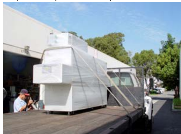
LA-306 pickup for American Export