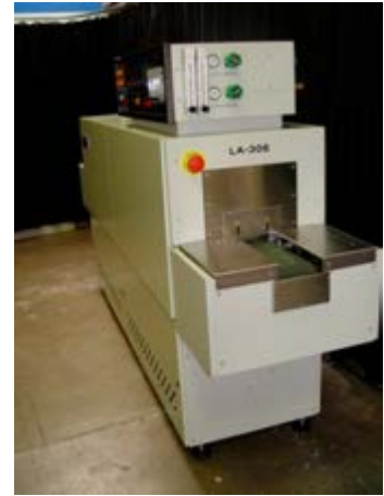
LA-306 with Supply Gas Mixing Option – Exit View