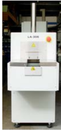
LA-306 Entrance (150 mm belt)