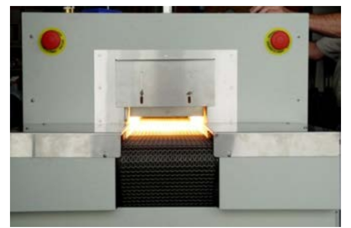
LA-309 During 1000 C burn-in