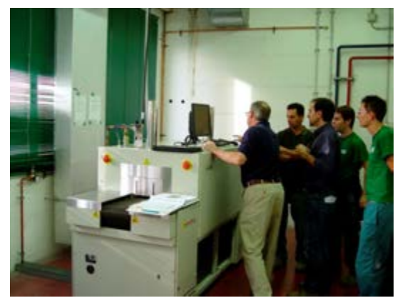
LA-309 Training in Rome, Italy