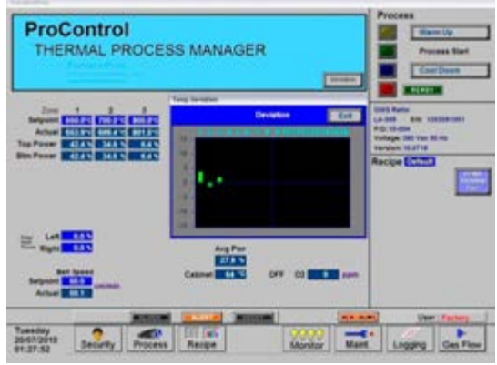
LA-309 Software Process Screen During @ 800 C Profile, Belt Speed: 50 cm/min