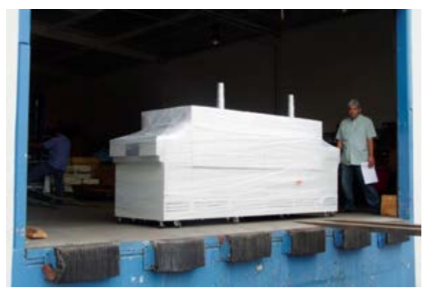
LA-309 on Loading Dock