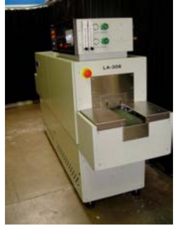
LA-306 with Supply Gas Mixing Option – Exit View