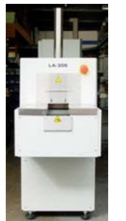
LA-306 Entrance (150 mm belt)