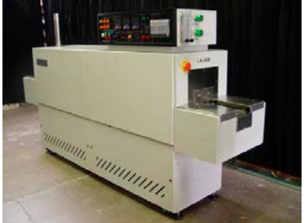
LA-306 Compact Annealing Furnace (3075 mm L x 500 mm W x 1615 mm H)

Three zone 1000C IR Forming Gas Annealing Furnace with 150 mm W belt and 50 mm H throat (furnace internal height) manufactured Chow Sang Sang Jewellery (Hong Kong) for annealing platinum, gold and silver alloys in a nitrogen and/or forming gas environment. Total heating length is 760 mm, cooling is 1140 mm. Supply gas mixing option allows fast switching between premixed Forming Gas (N2/H2 mix) and pure Nitrogen atmosphere. Pictures taken at our facility in Orange, California. Shipped 9Oct2012.