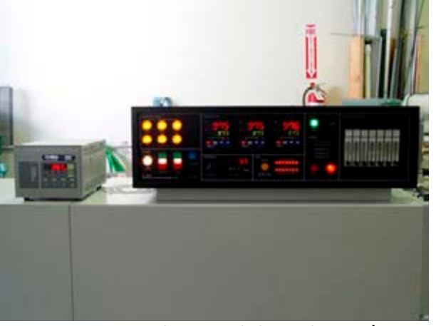
LA-306 Low O2 Trials @ 975C, belt speed 50 mm/min