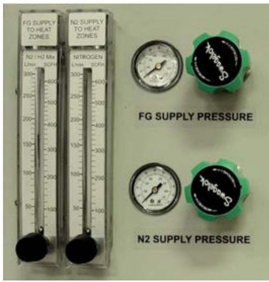
Controls for Optional Supply Gas Mixing System Only available on Dual Gas Furnaces