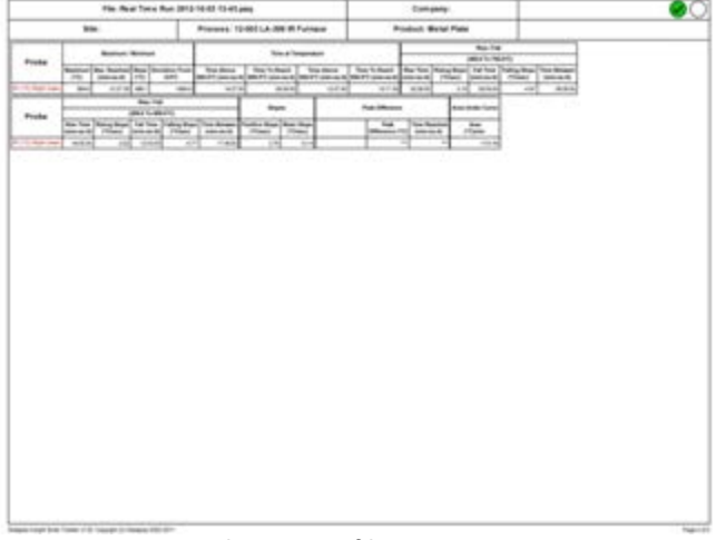
LA-306 High Temp profile @ 850C, page 2