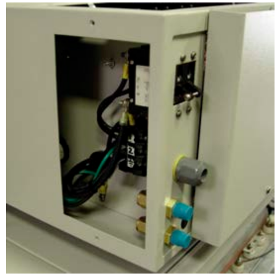
Control Console showing three options: Circuit Breaker; Dual Process Gas; and Sample Port