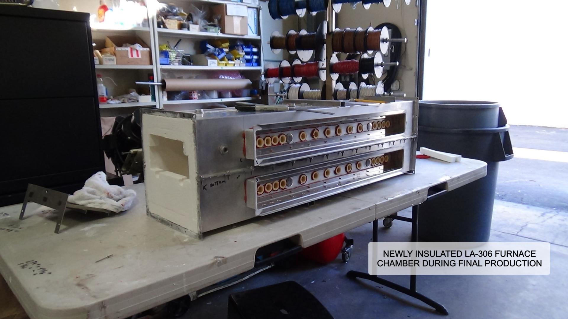
NEWLY INSULATED LA-306 FURNACE CHAMBER DURING FINAL PRODUCTION