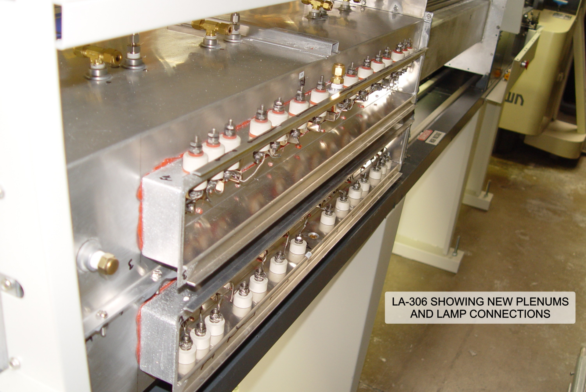
LA-306 SHOWING NEW PLENUMS AND LAMP CONNECTIONS