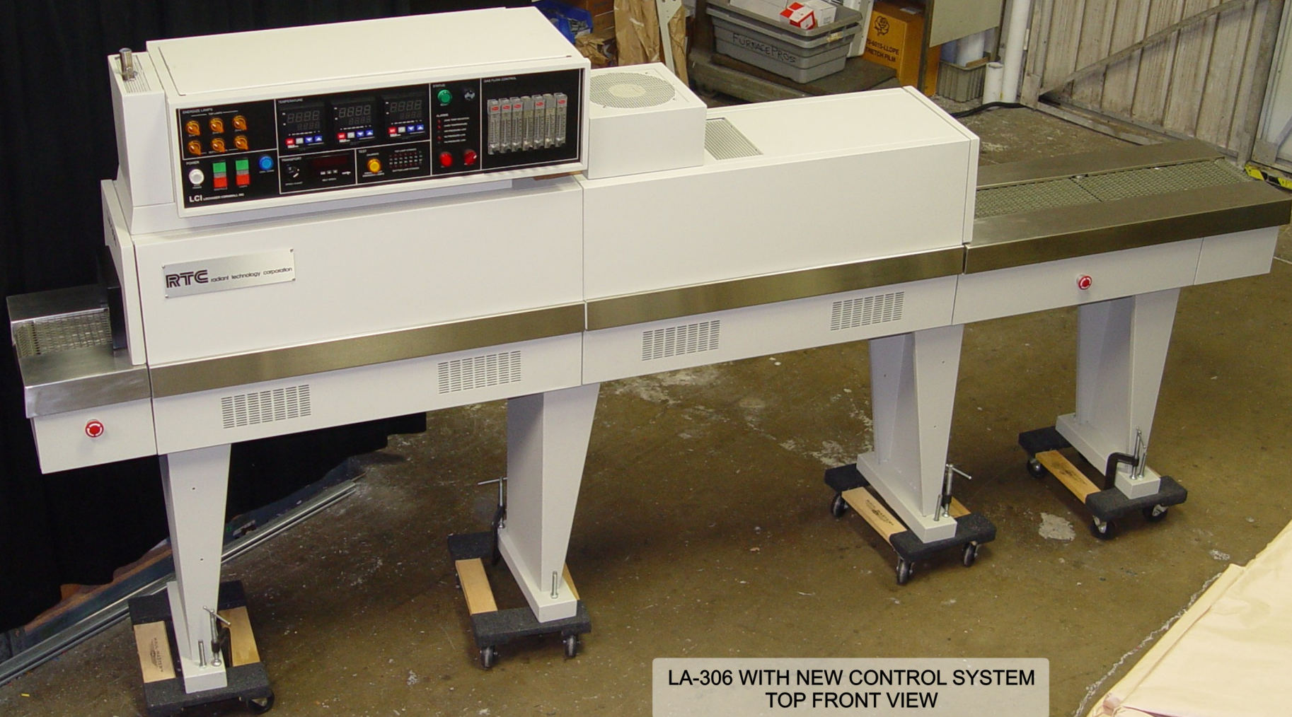
LA-306 WITH NEW CONTROL SYSTEM TOP FRONT VIEW