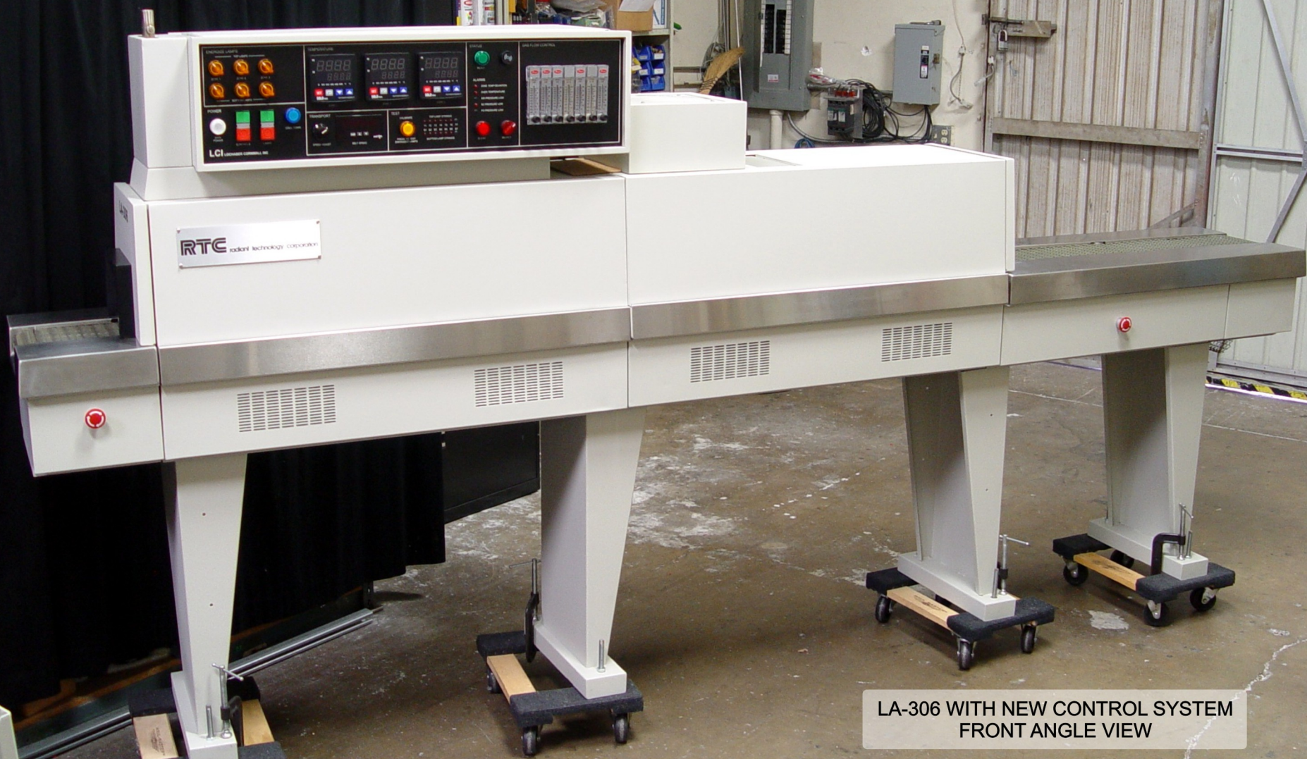
LA-306 WITH NEW CONTROL SYSTEM FRONT ANGLE VIEW